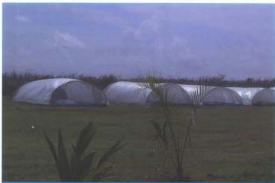
Salt production facility at Breakers farm location

Cayman Sea Salt has a unique retail booth with a sailing ship design at the Craft Market in George Town, located at the corner of South Church Street and Boilers Road. Cayman Sea Salt is sold along with their branded items such as hats, t-shirts and totes.