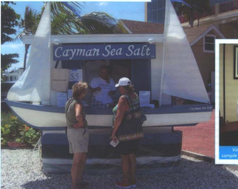
Cayman Sea Salt booth at the George Town craft market, Harbourfront